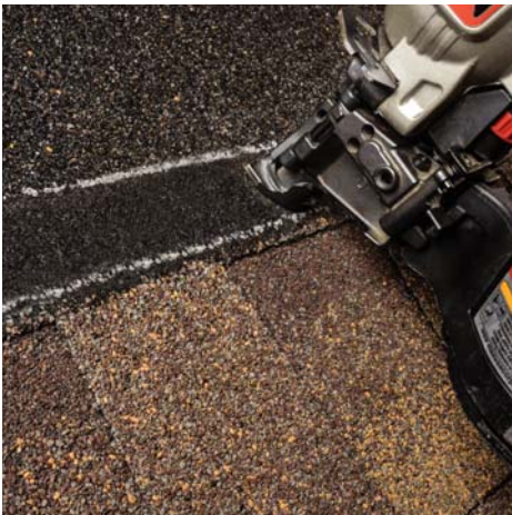
LayerLock™ Technology Powers the industry's widest nailing zone