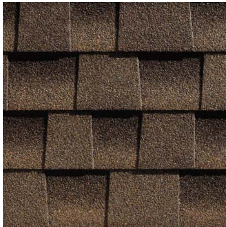
Beautiful finished look It's the same Timberline® Shingle you know and love, now even better